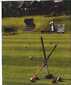
Take A Dip | Blantyre's heated pool (ABOVE LEFT) is conveniently located next to The Potting Shed Spa. Croquet, Anyone? | Two bent-grass croquet courts (ABOVE RIGHT) hearken back to another era. See Resources.

T ake a short trip to Lenox, MA, and you'll find yourself in a magical setting with myriad choices for outdoor and indoor activities. A weekend at Blantyre can satisfy the most avid hiker and the most dedicated antiques lover, with neither having to leave the grounds of this enchanting 19th-century country inn.