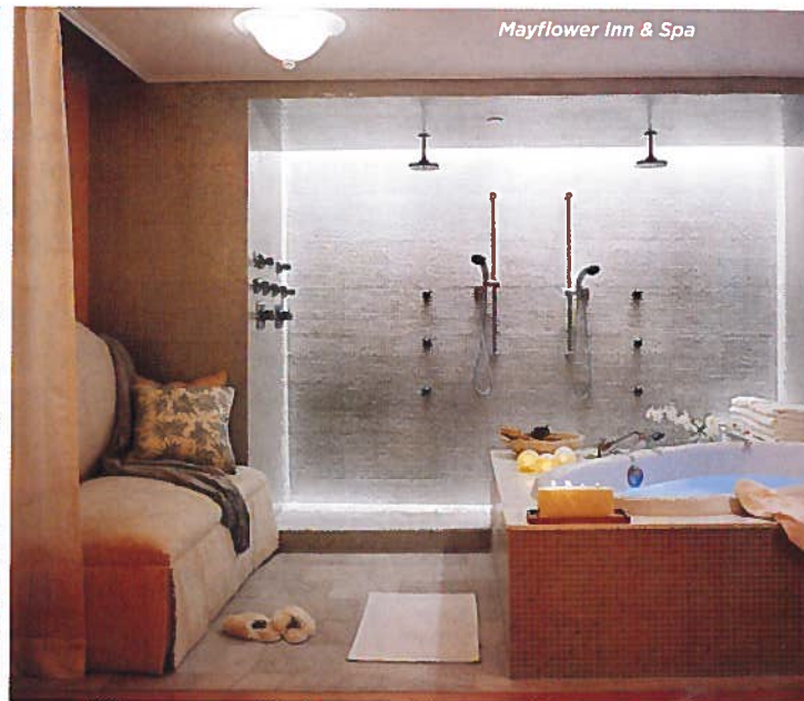
Mayflower Inn & Spa

G Sure, the Big Apple is great for a getaway if you're looking to blow off steam at the end of a hectic work week (or month or year). But when it comes to real rejuvenation, a vacation that leaves you refreshed rather than exhausted is in order, and that means going off the grid. Here are our top picks for leaving the world behind. We can feel our muscles unknitting already.